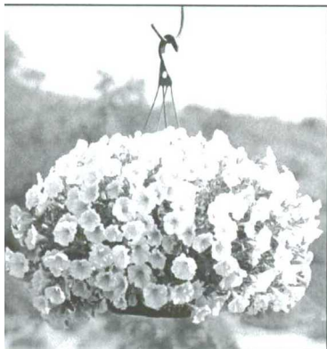
Petunia Sun Spun Yellow